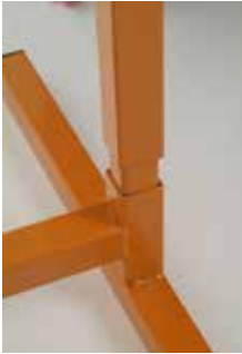
ST Series - easy slot together construction

Our ST Series frames are a heavy duty option with a slot together, 35mm box section construction and powder coated for a robust finish. Suitable for use with the Tusker curtain and strip range, with the curtain fitted over the uprights. Castors are available for extra mobility.