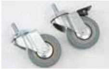
Tusker heavy duty frames can be fitted with castors for added mobility.