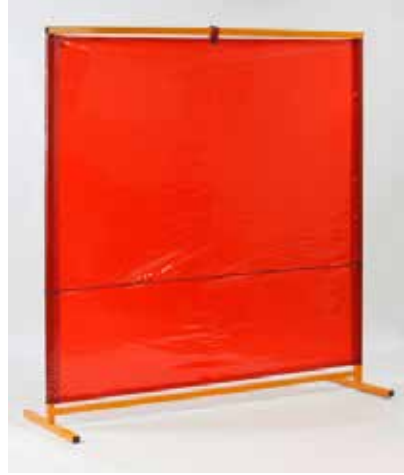
Available in a range of off-the-shelf or bespoke sizes and fitted with Tusker curtain or strip.