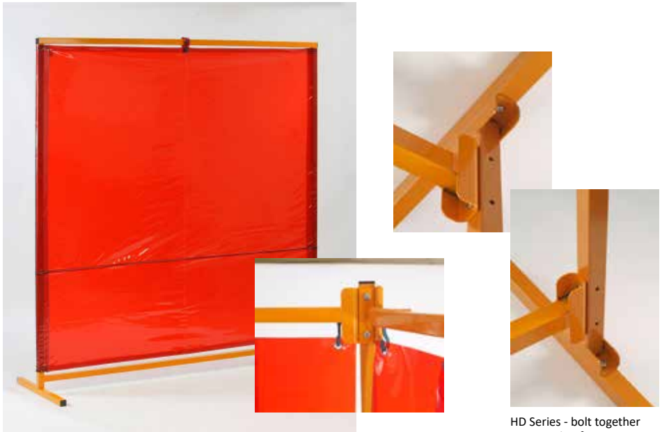
HD Series - bolt together construction for extra stability.

Constructed from 35mm box section steel for strength and powder coated for a robust finish. Features a top track section specially formed to suit Tusker hooks that are strong enough for all welding curtains and strips.